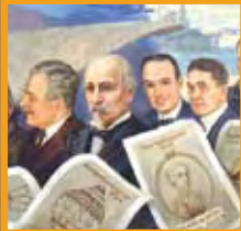
JUSTIN GRUELLE: The Early Birds Mural Page 12