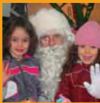
WRIGHT SPIRIT Holiday Celebration Page 14